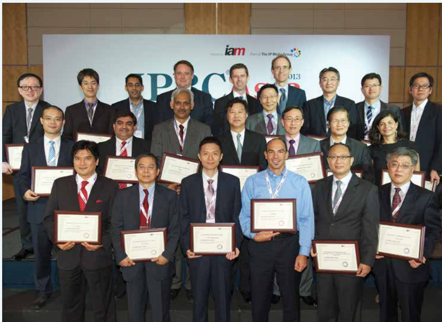
Representatives from Asia's IP Champions with the awards they received at the gala dinner